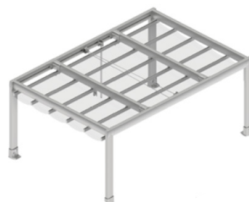
Free standing with four legs