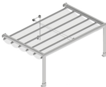
Wall-mounted with front legs (verandah)