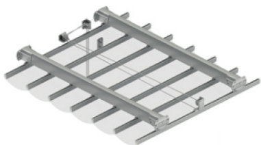
Mounted between walls or own structure